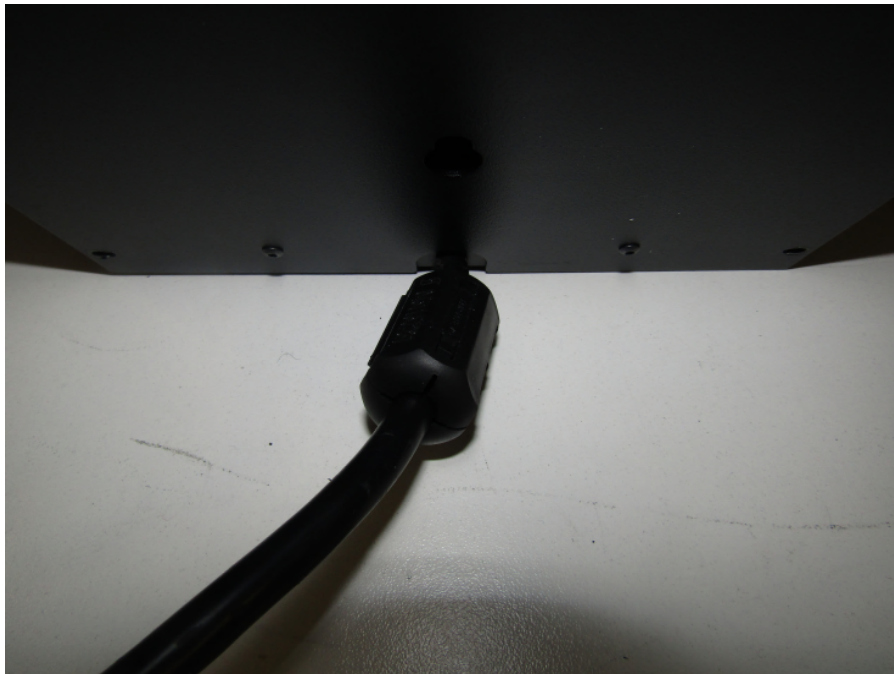
Figure A1: fair-rite Part # 0431167281 (1 pass) on AC power cord outside enclosure