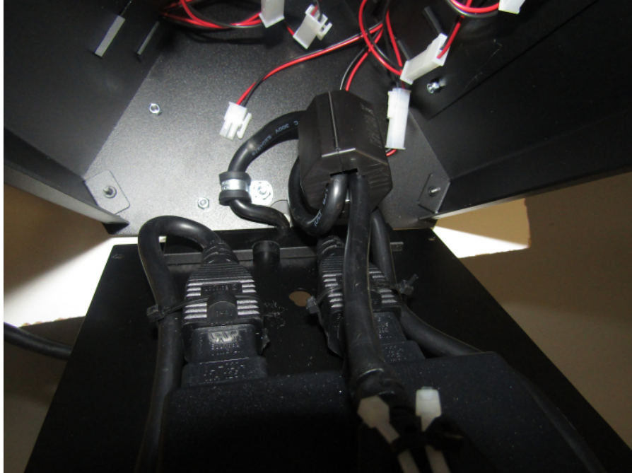
Figure A2: fair-rite Part # 0431176451 ( 2 pass) on AC power cord inside enclosure