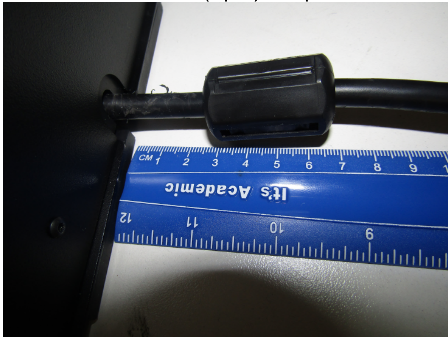
Figure A3: fair-rite Part # 0431167281 ( 1 pass) on AC power cord outside enclosure