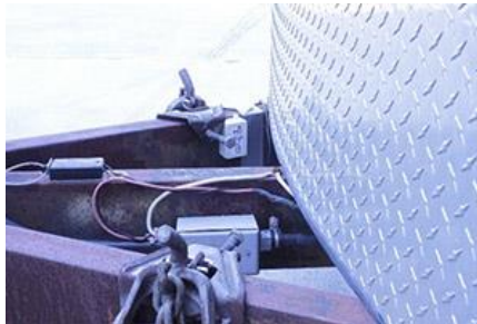
Front of Car Hauler