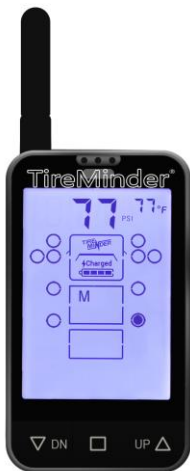
Dually Truck and 5 TH Wheel 10 Tires