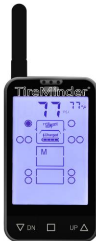
MotorHome and Tow Car 10 Tires