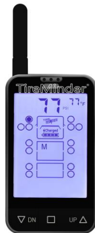
MotorHome, Toy Hauler and Boat 14 Tires