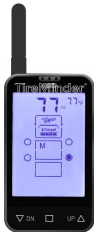
5 TH Wheel 4 Tires

The TM77 has the ability to add up to 22 tires. As it is unlikely you will use all 22 positions, below you will find some recommendations of where to add tire positions. Ultimately, it is up to you to decide how you would like the TM77 to look. So have fun with it!