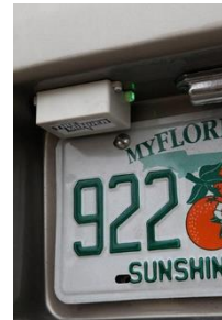
Attached to License Plate Light