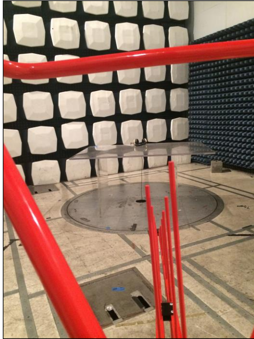
Photograph 1. Radiated Emission Set up, 30 MHz - 1 GHz