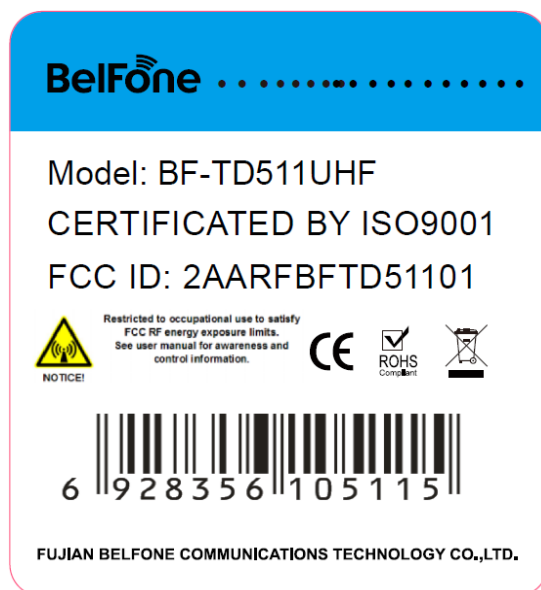
EXHIBIT A - FCC ID LABELING AND LOCATION