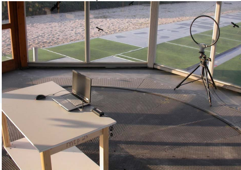
Open area test site