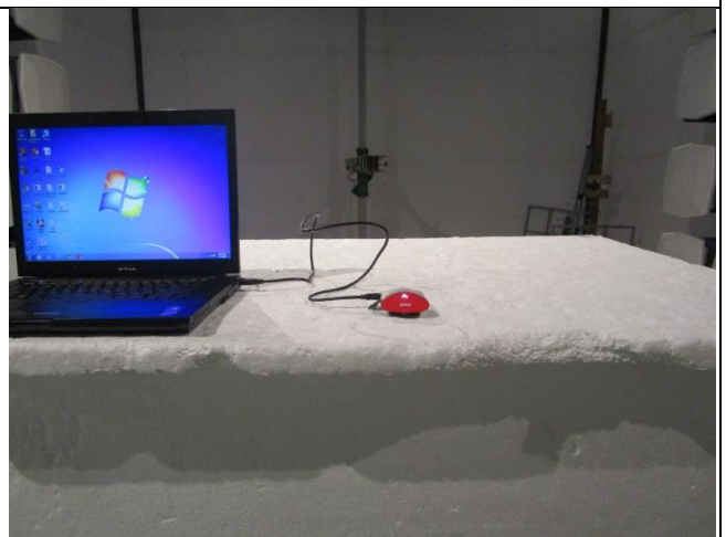
Radiated Emissions (>1GHz) – Rear View

Note: The spurious emission in different EUT orientation was investigated, including the EUT standing up position and the laying down position. The EUT orientation shown in above setup photo is the worst case position.