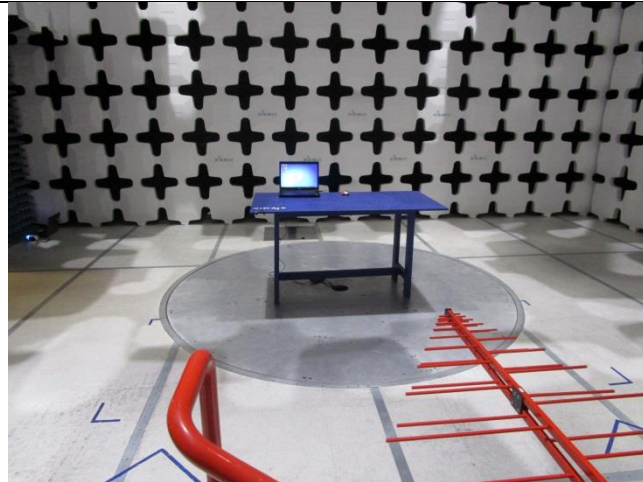
Radiated Emissions (<1GHz) – Front View