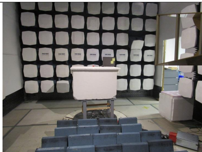
Radiated Emissions (>1GHz) – Front View