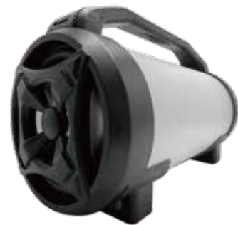
Operation Manual DG-PLDT