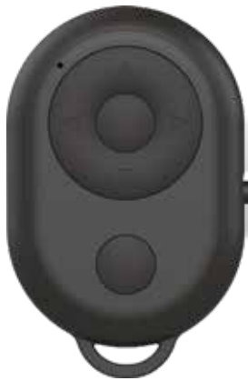
Phone Remote Controller Operation Manual FB-RCS1