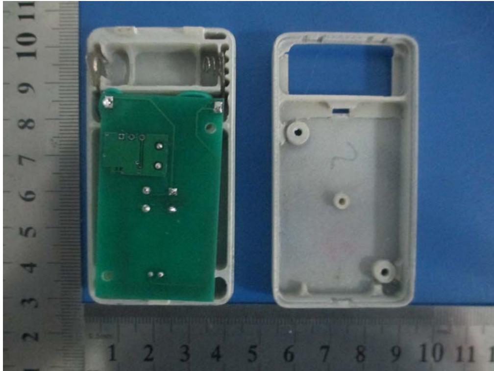
EUT Uncover - Front View