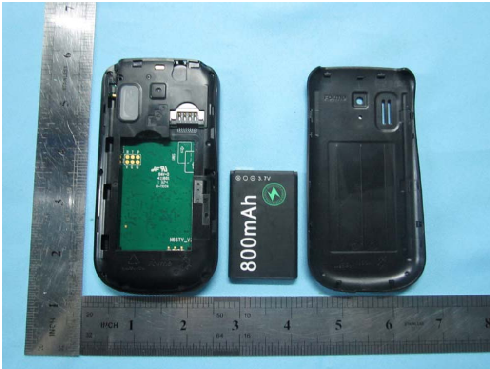
Cover Off - Top View