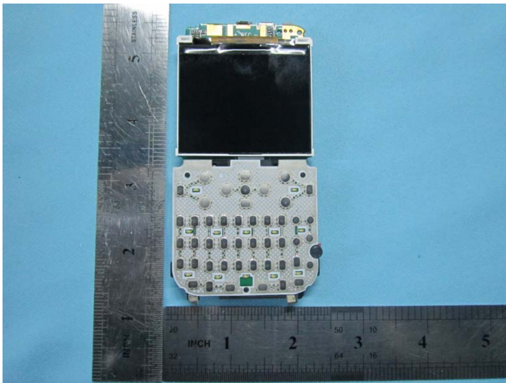
Mainboard - Top View