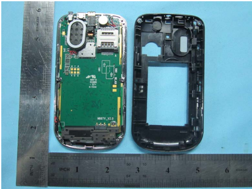
Cover Off - Rear Housing View