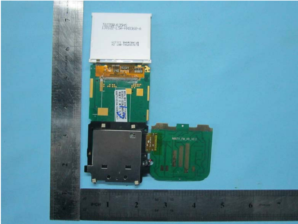
Mainborad Uncover- Top View