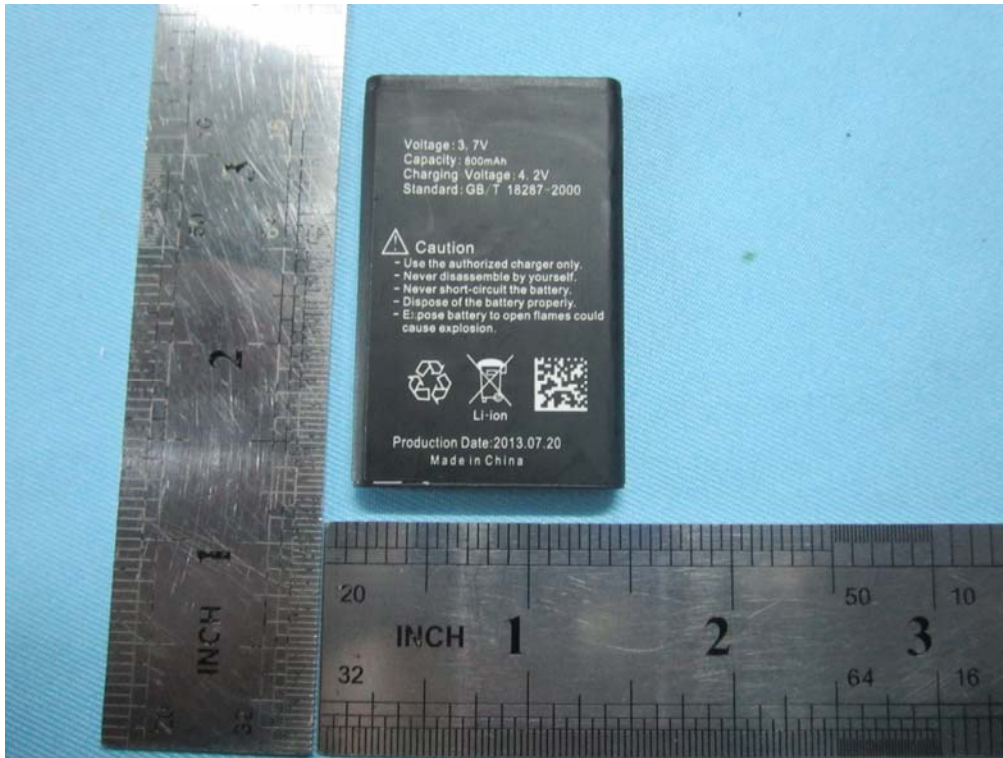
Battery –Bottom View