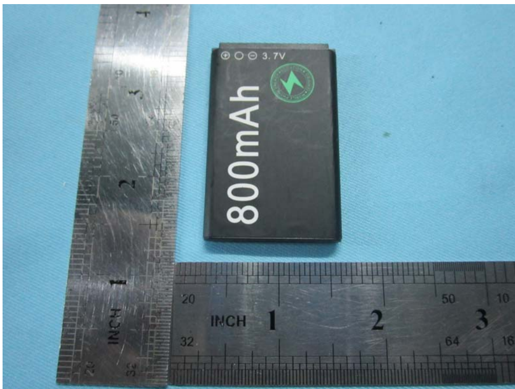
Battery – Top View