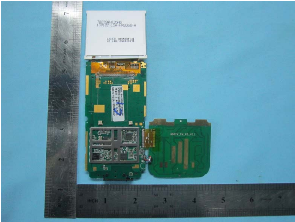
Mainborad Without Shielding - Top View