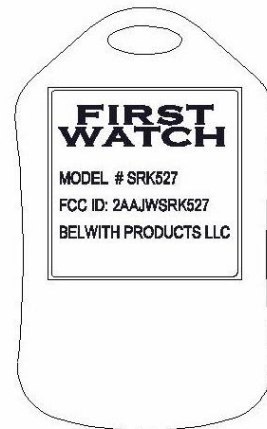
REAR VIEW OF KEYFOB

Do not remove the "FIRST WATCH" label shown on back of KeyFob/device. It contains important information regarding FCC