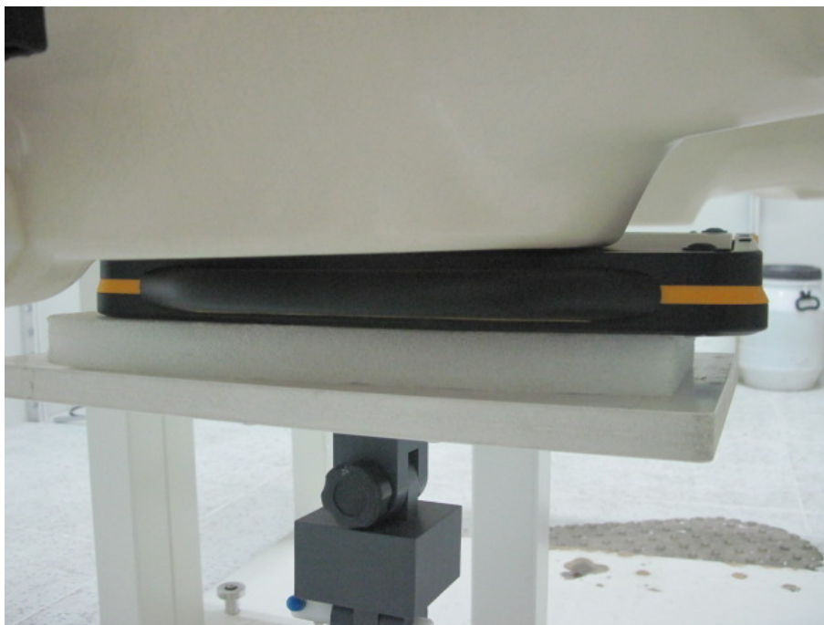
Body SAR Bottom of Tablet 0mm for GPRS/WCDMA