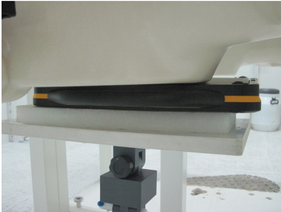
Body SAR Bottom of Tablet 0mm for Wi-Fi