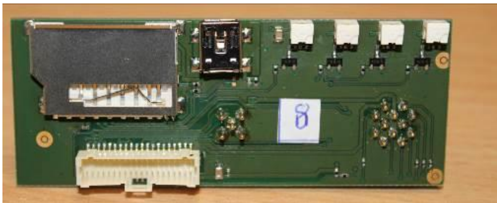
Figure 4:- 010-0055 PCB (011-0058)