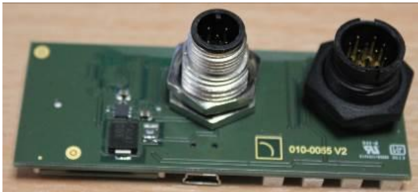
Figure 3:- 010-0055 (011-0058) PCB