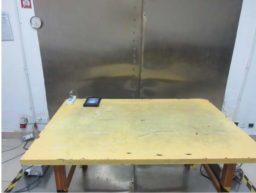
Conducted Emission Rear View