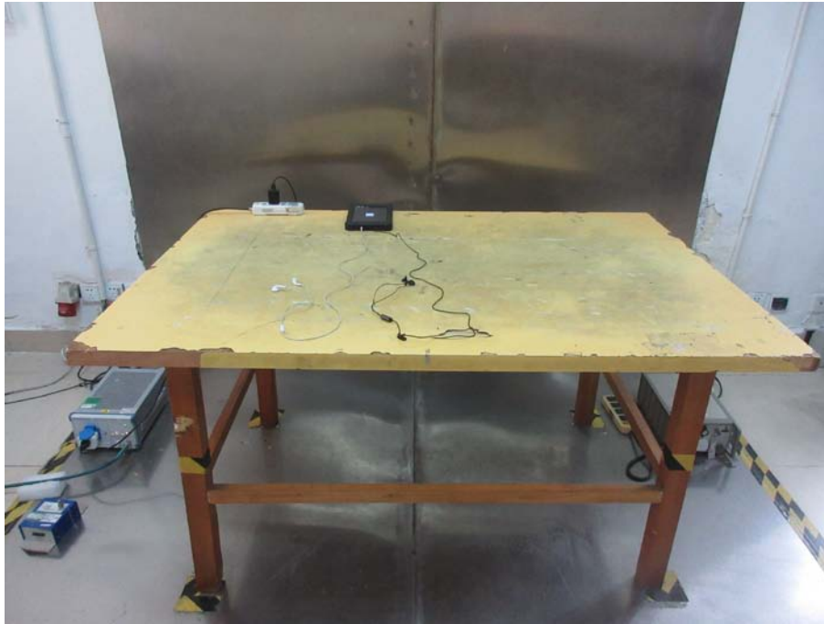
Conducted Emission Rear View