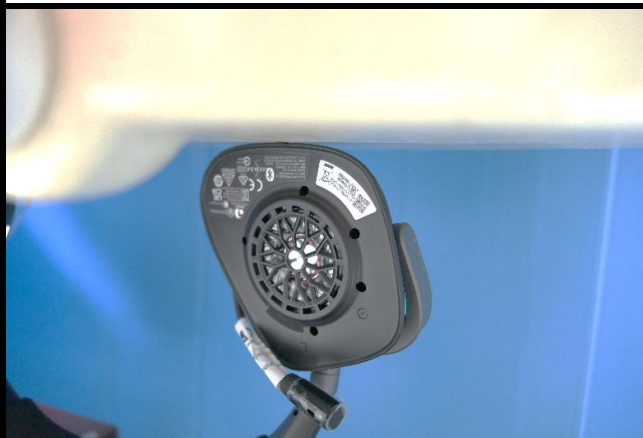
Bottom Side of EUT Tested at 0 mm