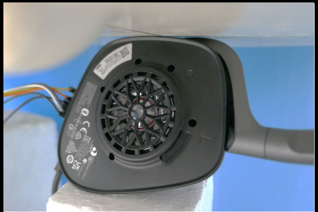
Rear Face of EUT Tested at 0 mm