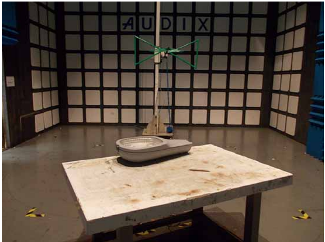
SETUP WITH MAXIMUM DETECTED EMISSION AT HORIZONTAL POLARIZATION