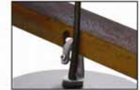
Tighten the screw which on the hoop to avoid the loss. angle iron parameters (Size: 4cm x 4cm x 10cm, Aperture: \geq 12\text{mm} , Bear load: \geq 5 times the weight of lamps and lanterns)