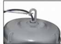
Unscrew the screw which on the hoop.