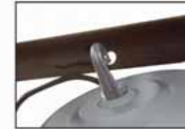
Install the hoop on the right hole position