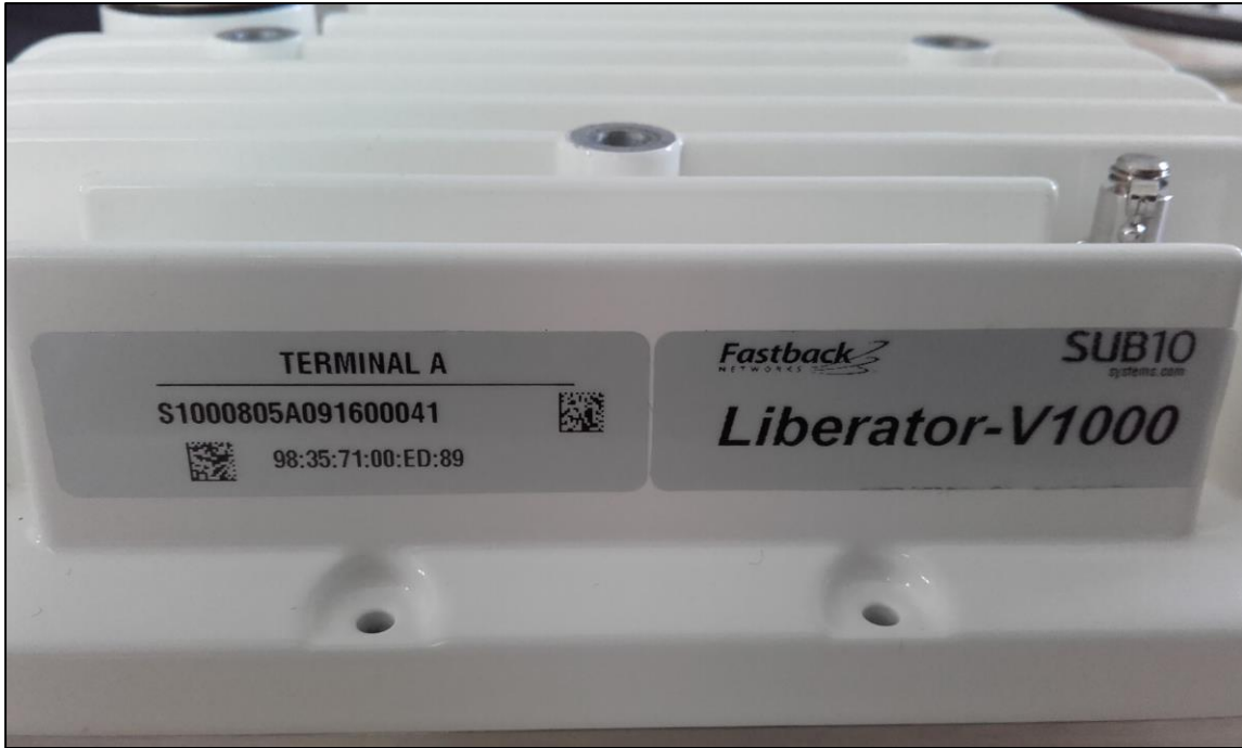
Figure 5: Close-up view of label with serial number, MAC address and QR code, and also model number label.