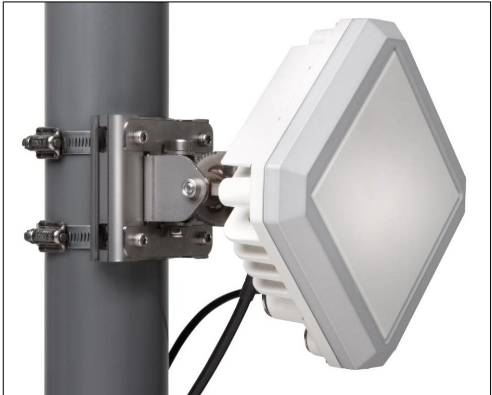
Figure 7: View of Liberator-V1000 Dual-port mounted on a pole, in normal operation.