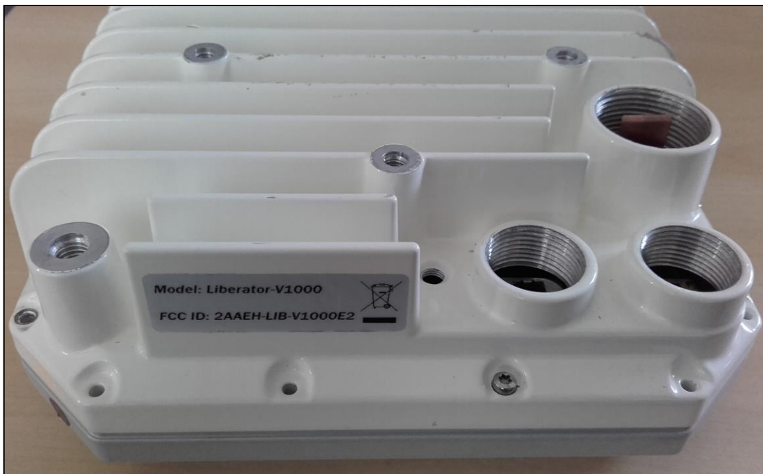
Figure 3: Rear view of Liberator-V1000 Dual-port showing polarization marking dot on antenna front frame, and FCC regulatory label