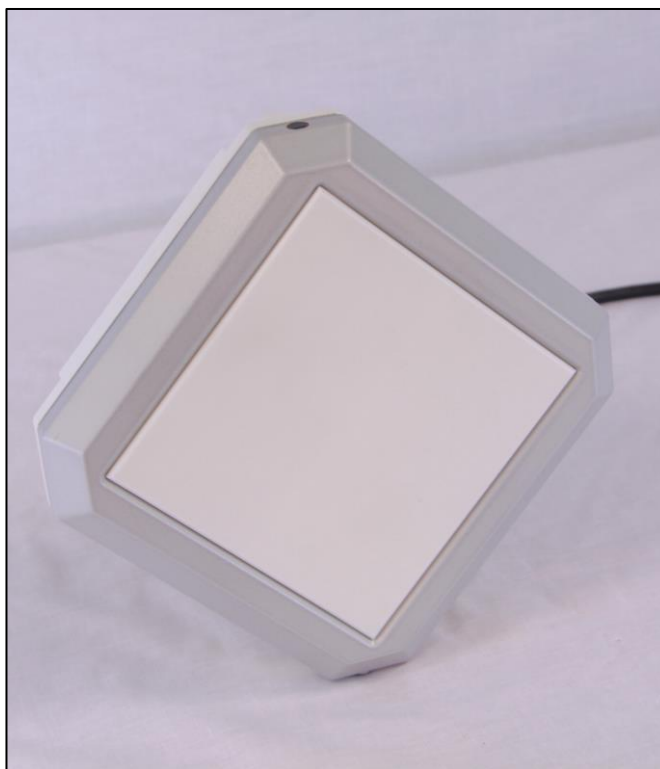
Figure 2: Front view of Liberator-V1000 Dual-port showing polarization marking dot on antenna front frame