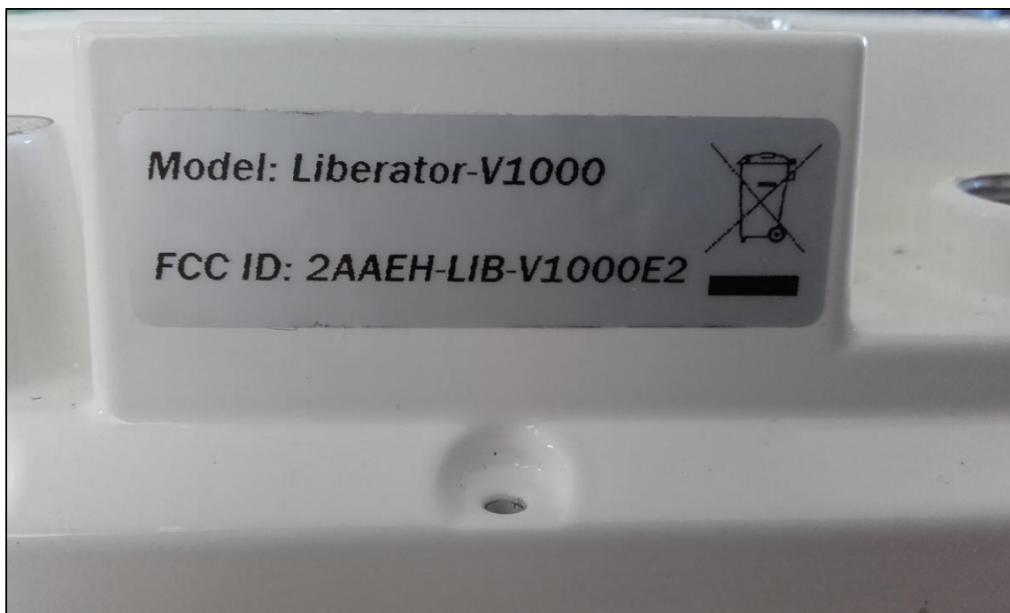
Figure 4: Close-up view of FCC regulatory label