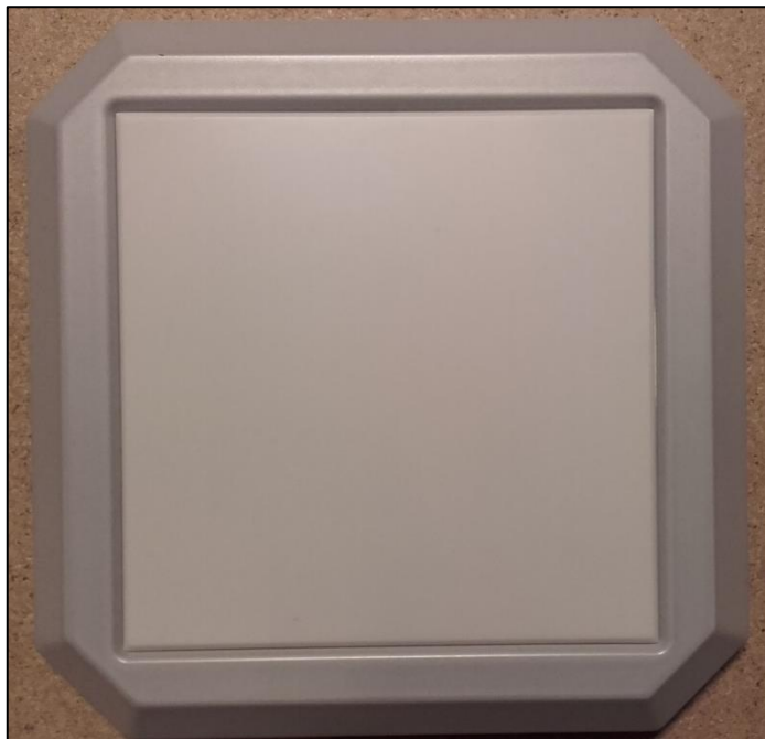
Figure 1: Front view of Integrated Antenna and Radome