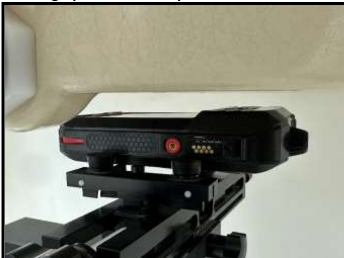
Front Face of EUT with 1.0 cm Gap