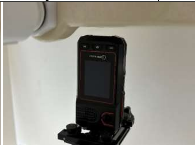
Bottom Side of EUT with 1.0 cm Gap