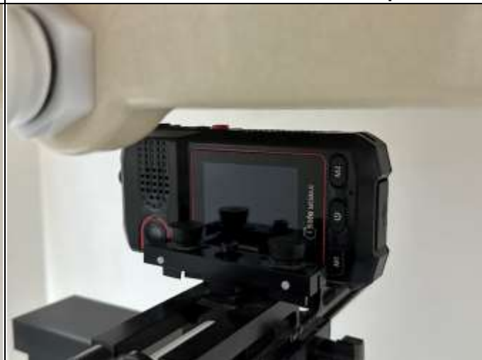
Right Side of EUT with 1.0 cm Gap