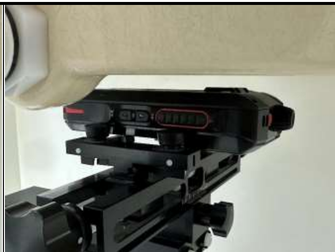
Rear Face of EUT with 1.0 cm Gap