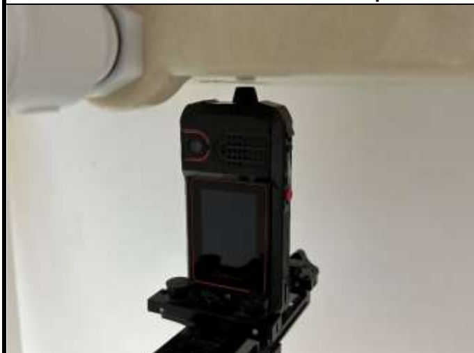
Top Side of EUT with 1.0 cm Gap