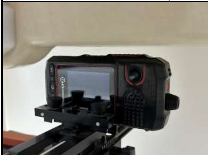
Left Side of EUT with 1.0 cm Gap