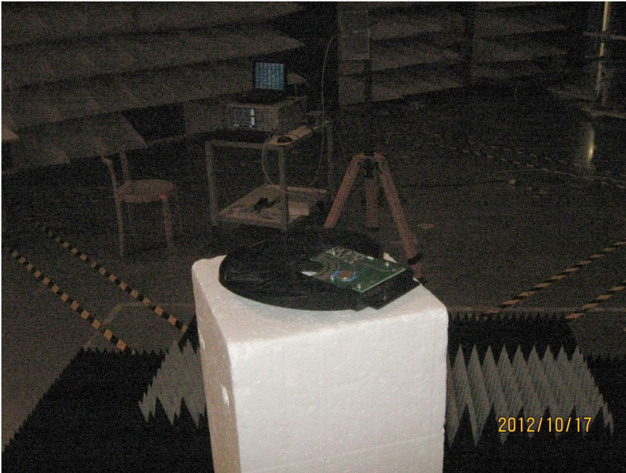
Photograph A1-3: Carrier measurement (SAC)