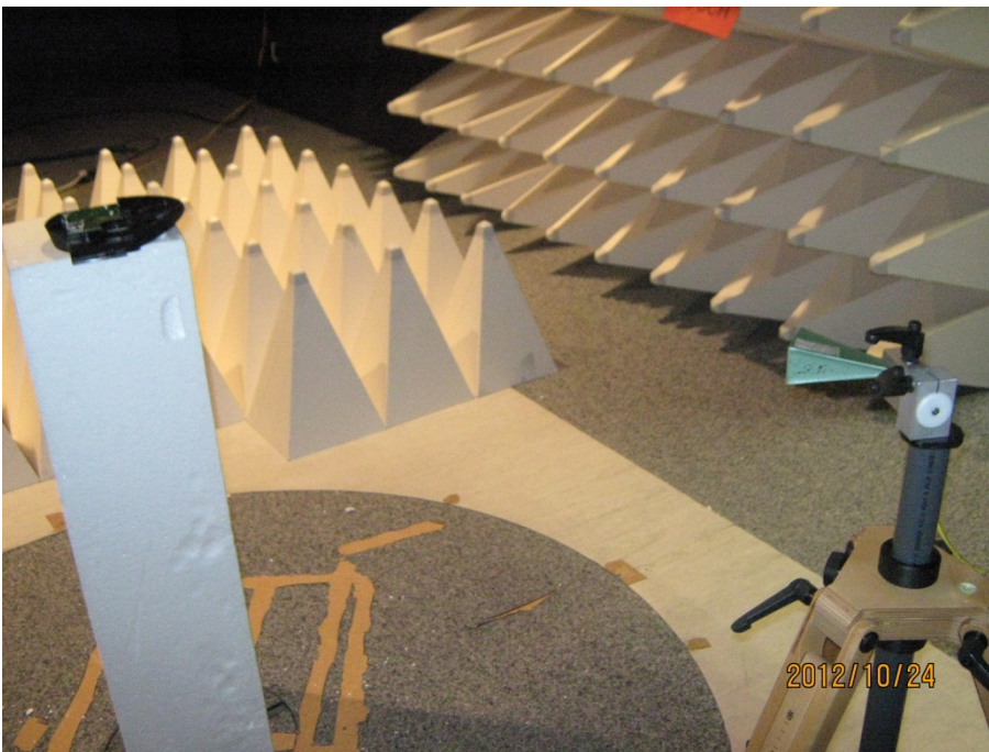
Photograph A1-4: Measurement above 18 GHz (FAC)