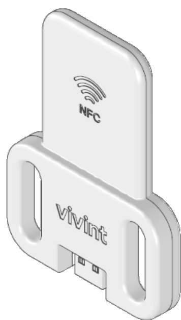
NFC Dongle (side view) —

CAUTION: Changes or modifications not expressly approved by the party responsible for compliance could void the user's authority to operate the equipment.