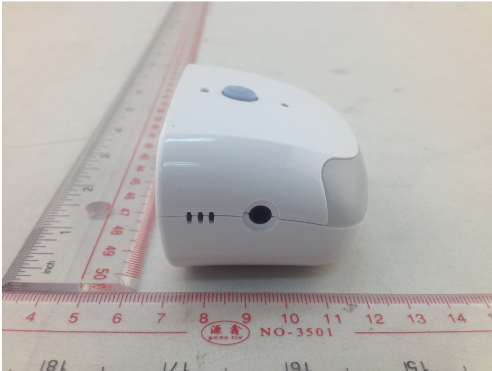
THE LEFT OF BABY