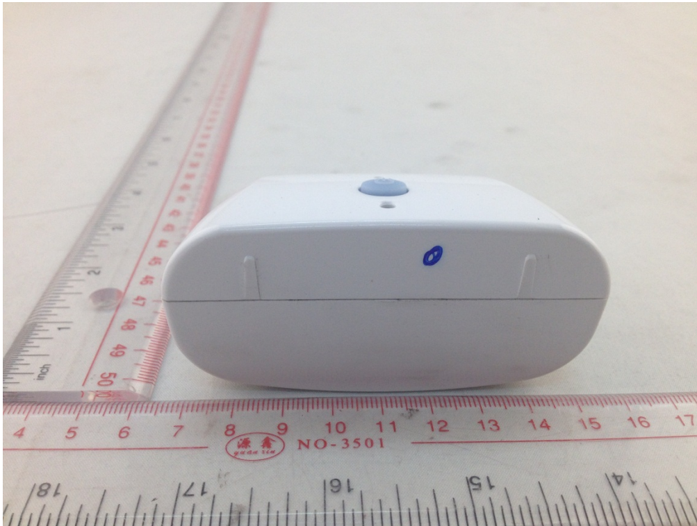
THE DOWN OF BABY