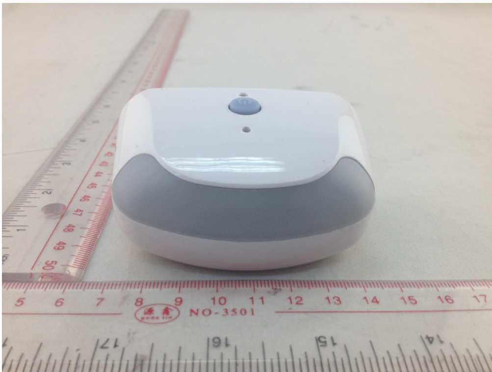
THE UP OF BABY