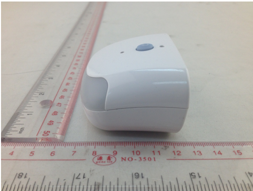
THE RIGHT OF BABY