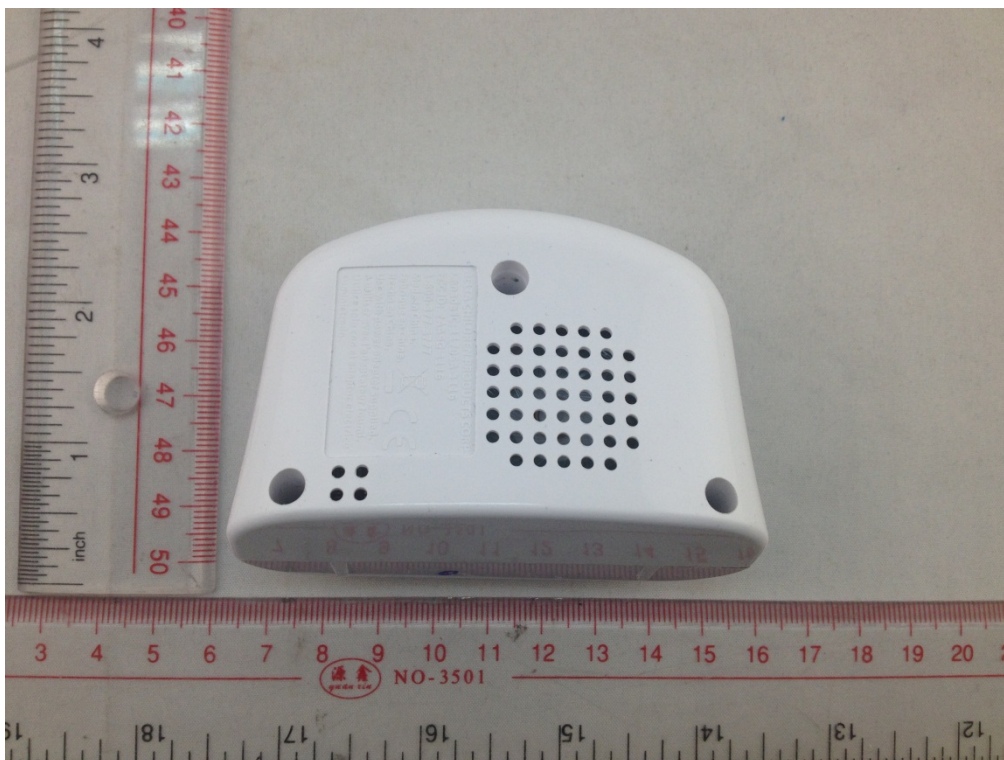
THE BACK OF BABY