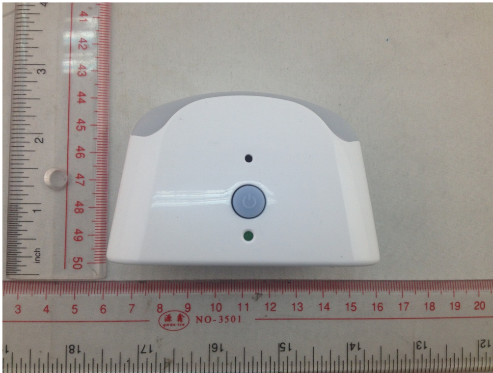
THE FRONT OF BABY