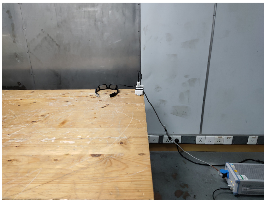
Photo of Conducted Emission Measurement