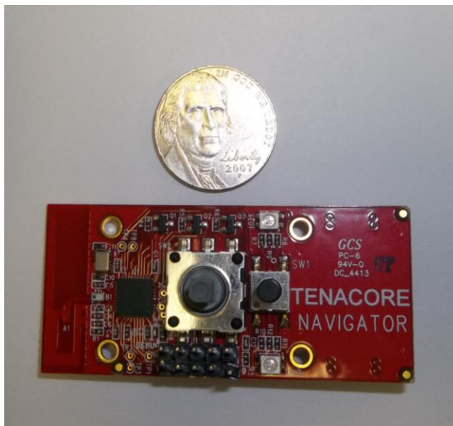
Figure 1. Top View