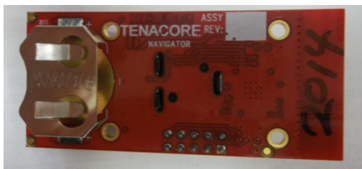
Figure 2. Bottom View