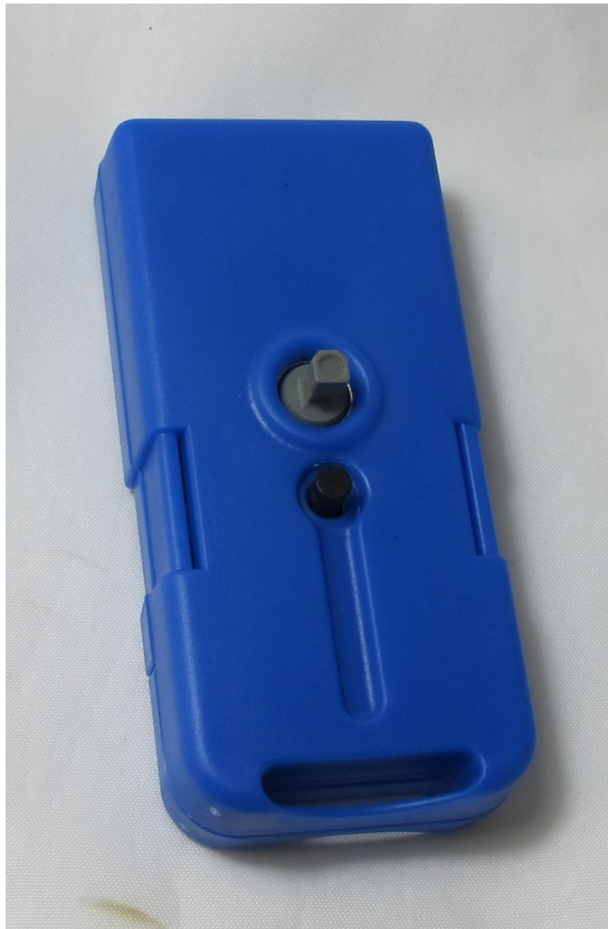
Figure 1. Top