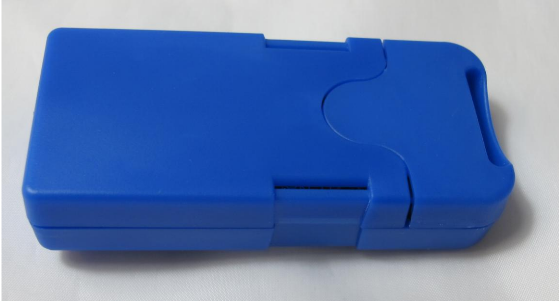
Figure 3. Bottom

FCC Part 15.249 13-0310 January 29, 2014 BM-1 2AA65-BM1 D5W, Inc.