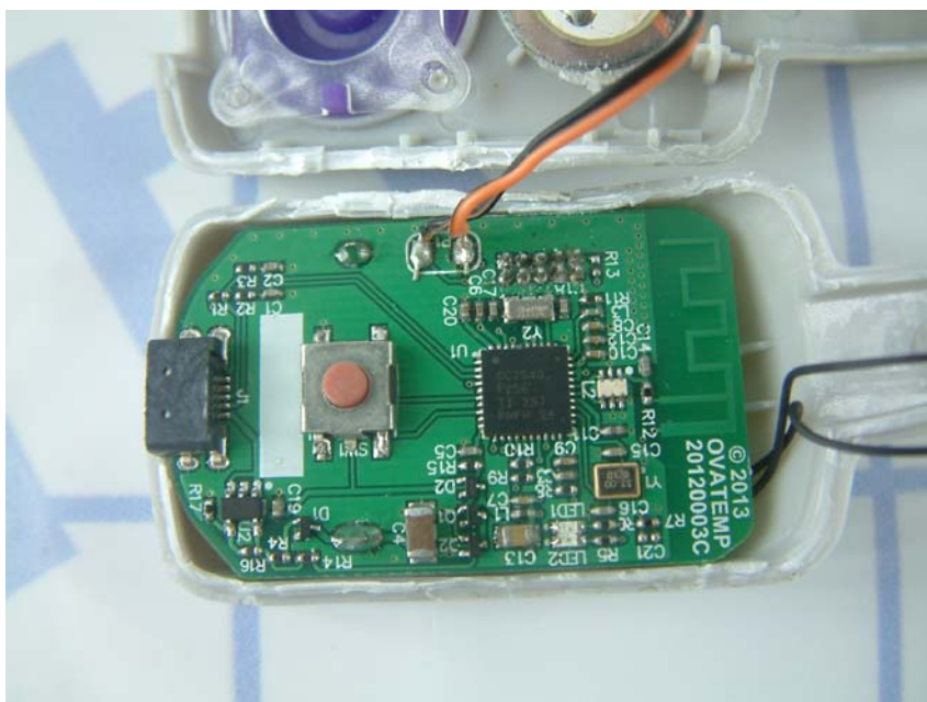
PCB view side 1

Copyright of this report is owned by Centre of Testing Service and may not be reproduced other than in full except with the written approval of the issuing Company.