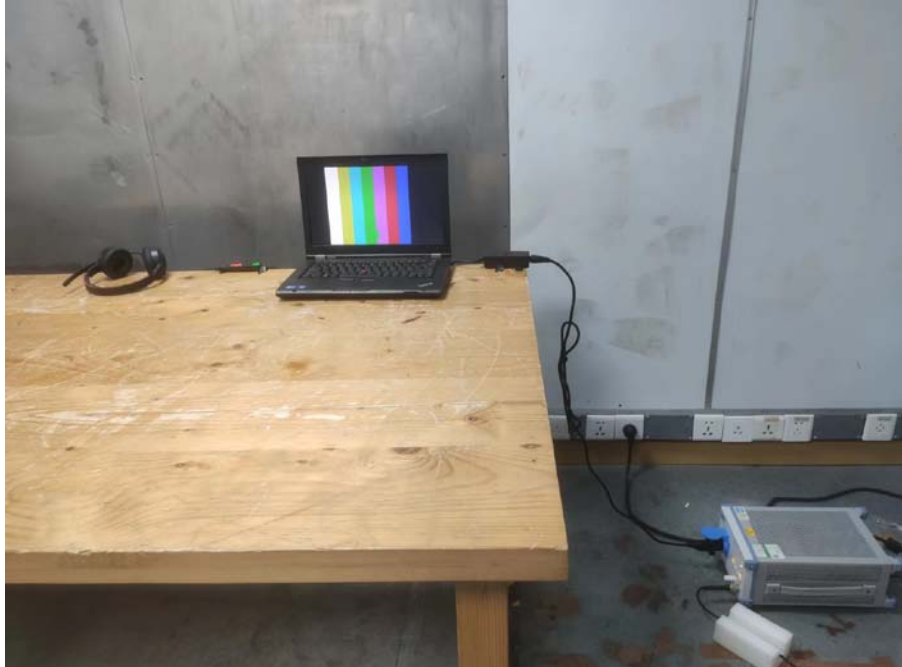
Photo of Power Line Conducted Emission