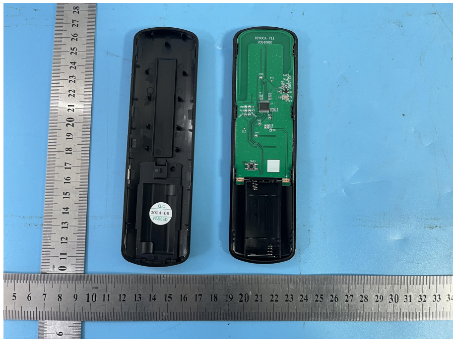
INTERNAL PHOTO OF SAMPLE PCB