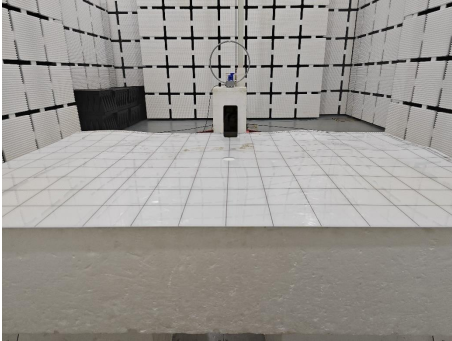
Set-up for Transmitter & Receiver Spurious Emissions, 30MHz to 1000MHz