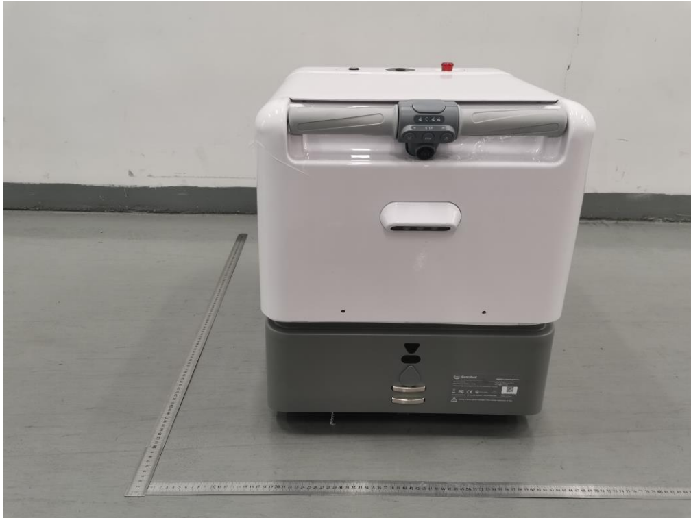
OUTSIDE VIEW-5 OF EUT