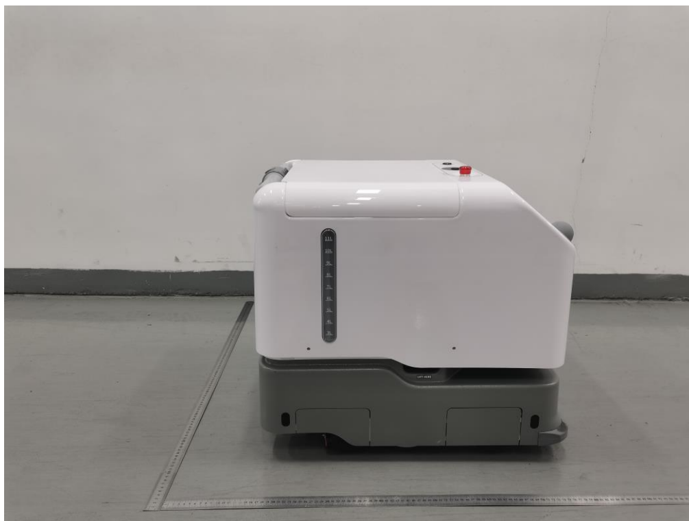
OUTSIDE VIEW-6 OF EUT