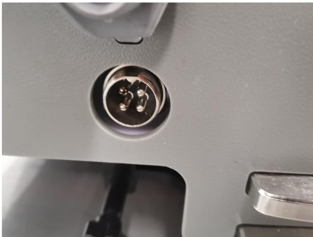
PORT VIEW-2 OF EUT