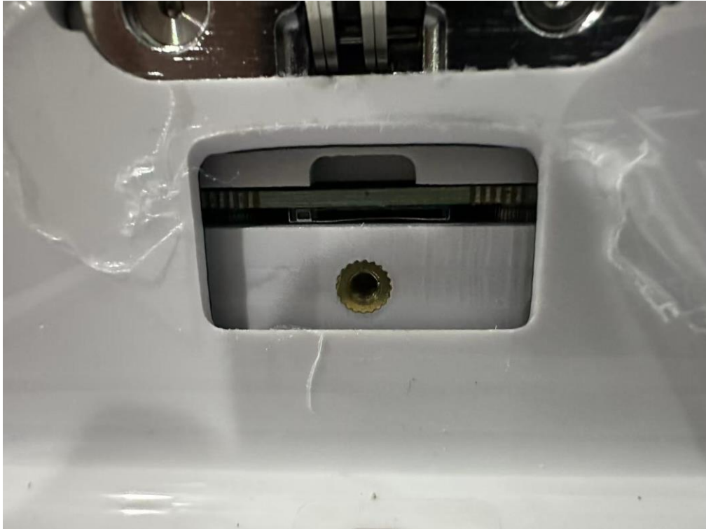
SVBR01CL(Model name of the factory: S100 Pro M) OUTSIDE VIEW-1 OF EUT