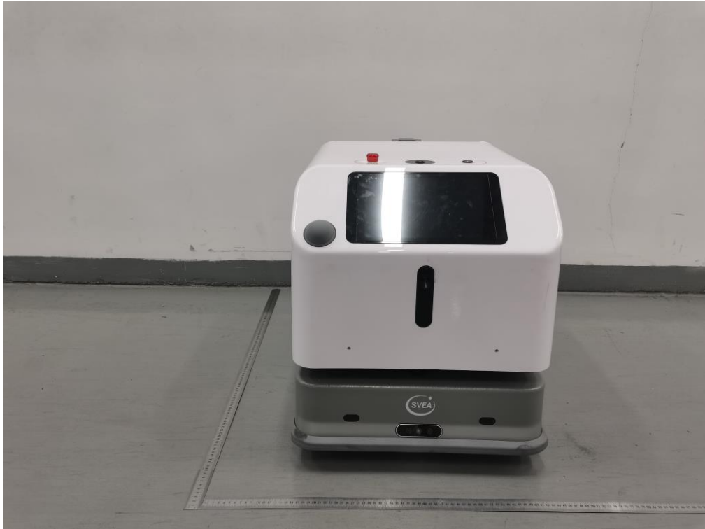
OUTSIDE VIEW-4 OF EUT