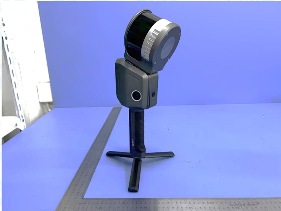
Photo 4 Appearance of EUT