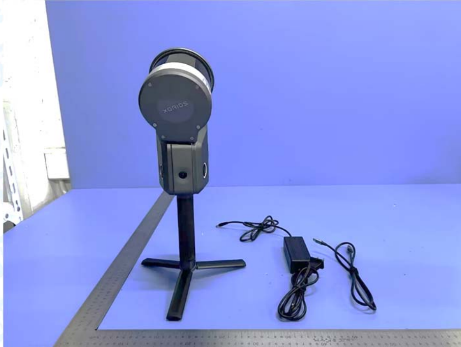
Photo 2 Appearance of EUT