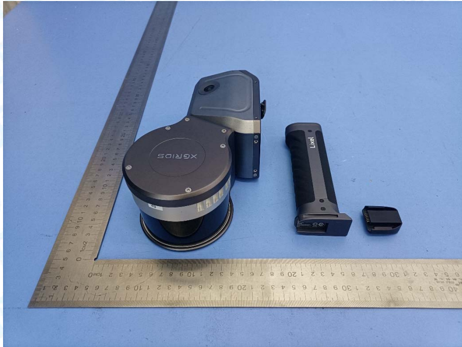
Photo 6 Appearance of EUT