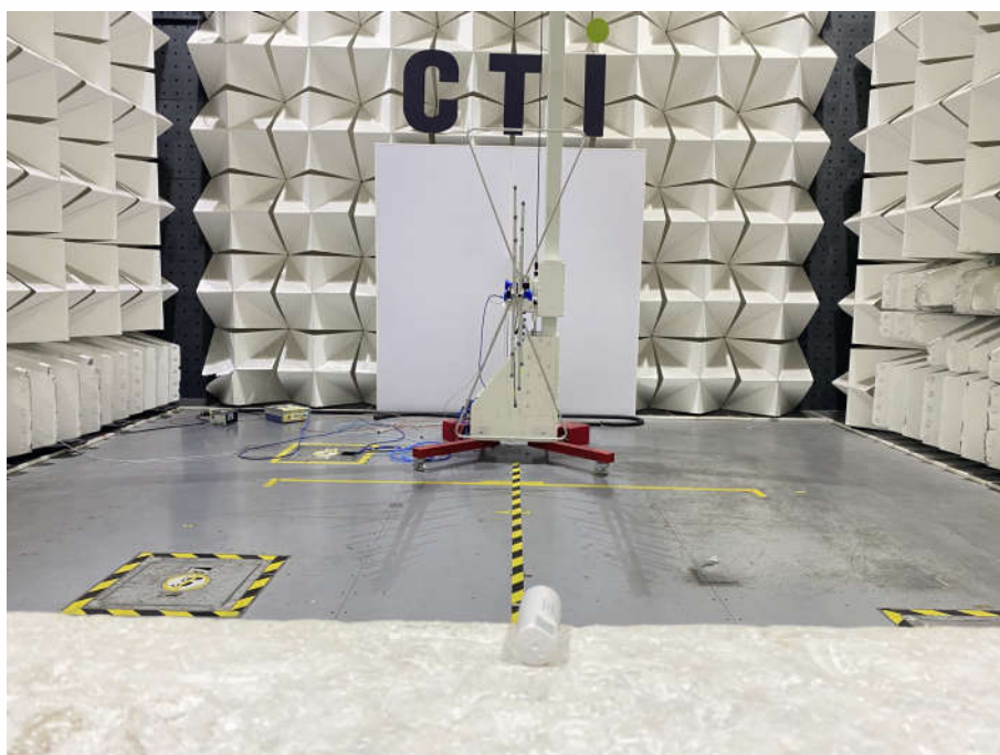
Radiated spurious emission Test Setup-2(Below 1GHz) Close up