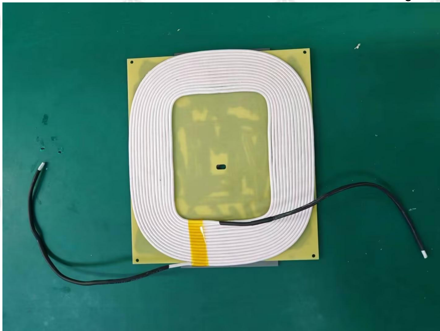
View of Product-127