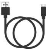
1 x Charging Cable for Karaoke Machine