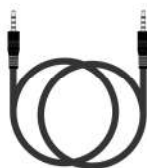
1 x 3.5mm AUX Cable