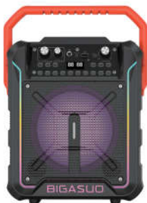
1 x Portable Karaoke Machine