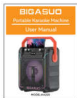
1 x User Manual