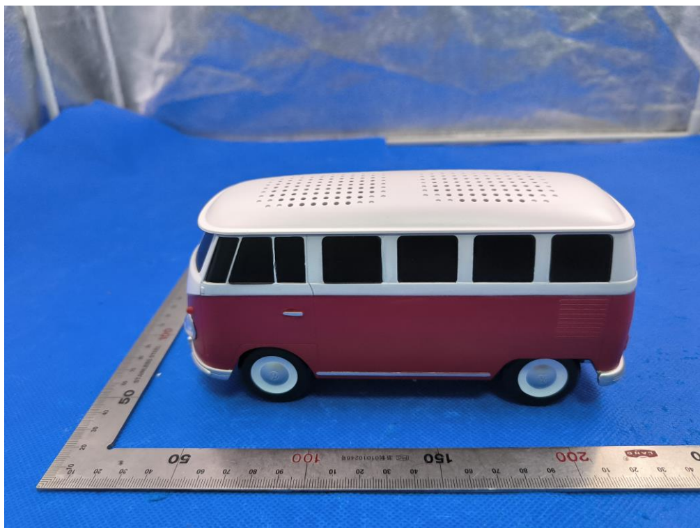
PORT VIEW OF EUT