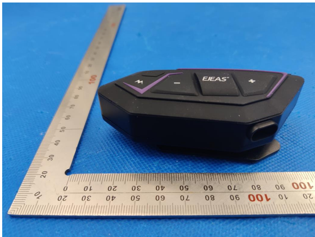
PORT VIEW OF EUT