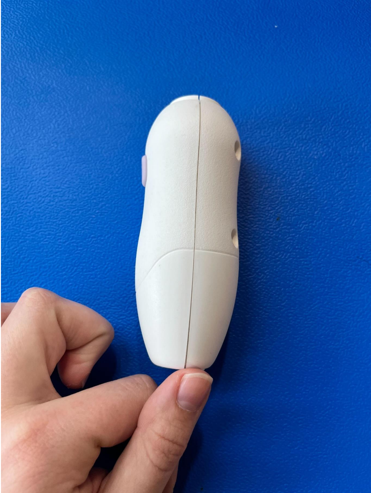
Figure 3: View 3