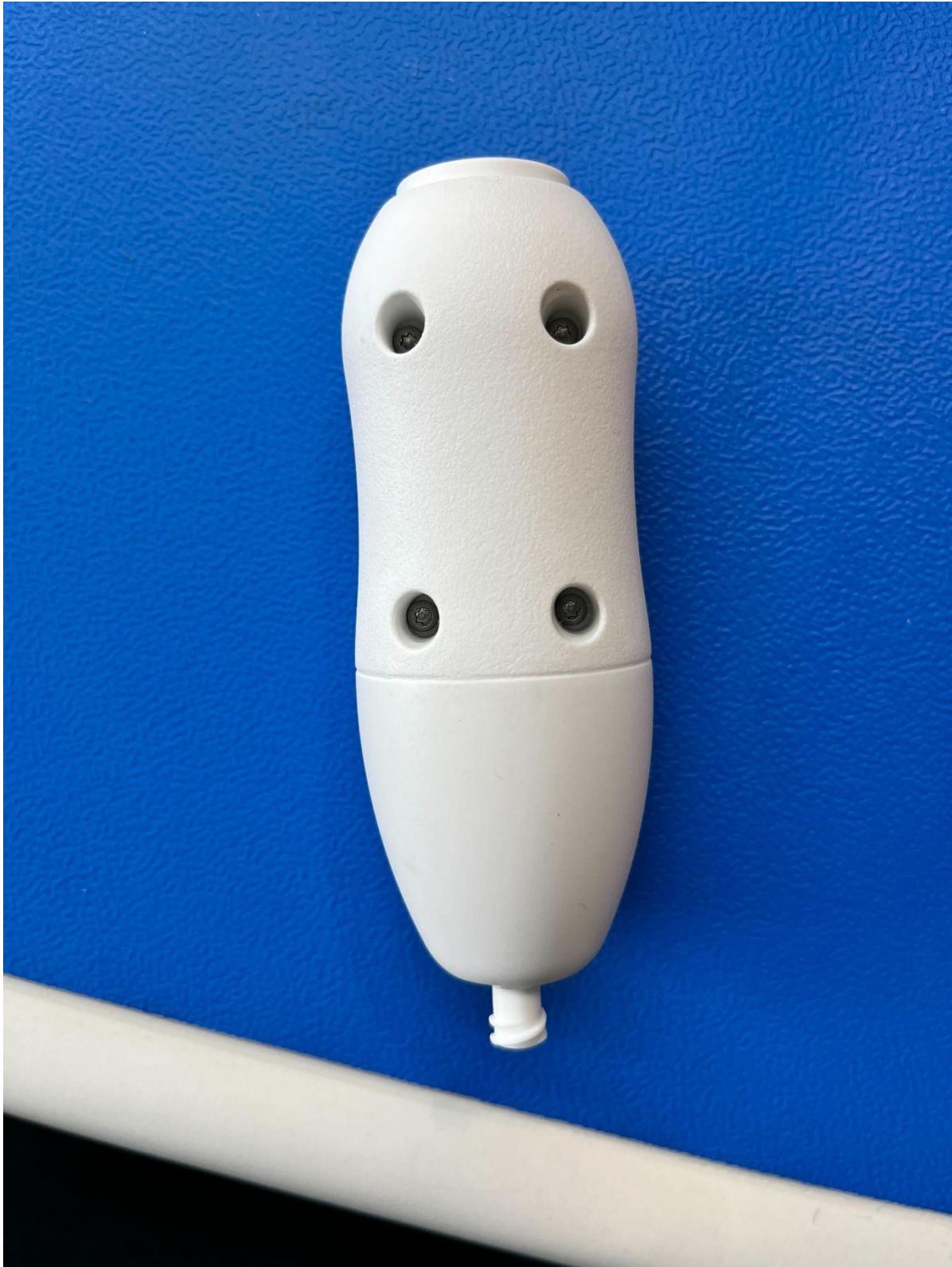
Figure 4: View 4