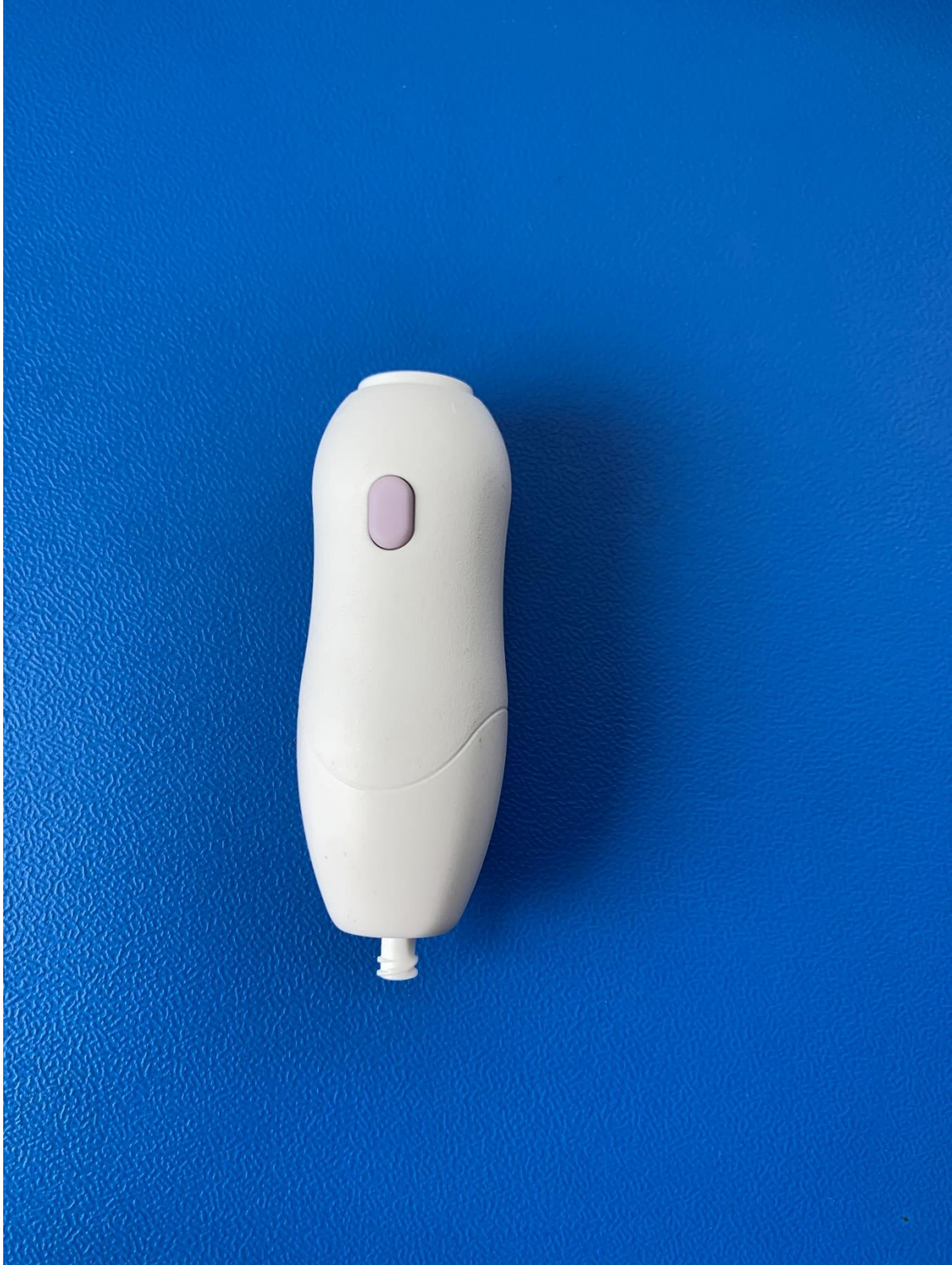
Figure 1: View 1