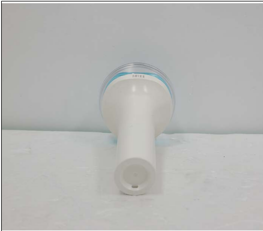
Model name: NMIXX_V1