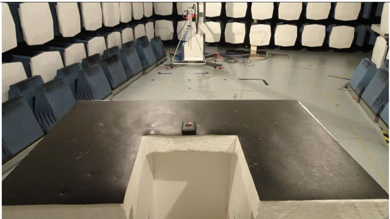
Picture 12, Radiated Spurious Emissions, EUT setup, TX and RX 30 – 1000 MHz and RX 1 – 12,75 GHz