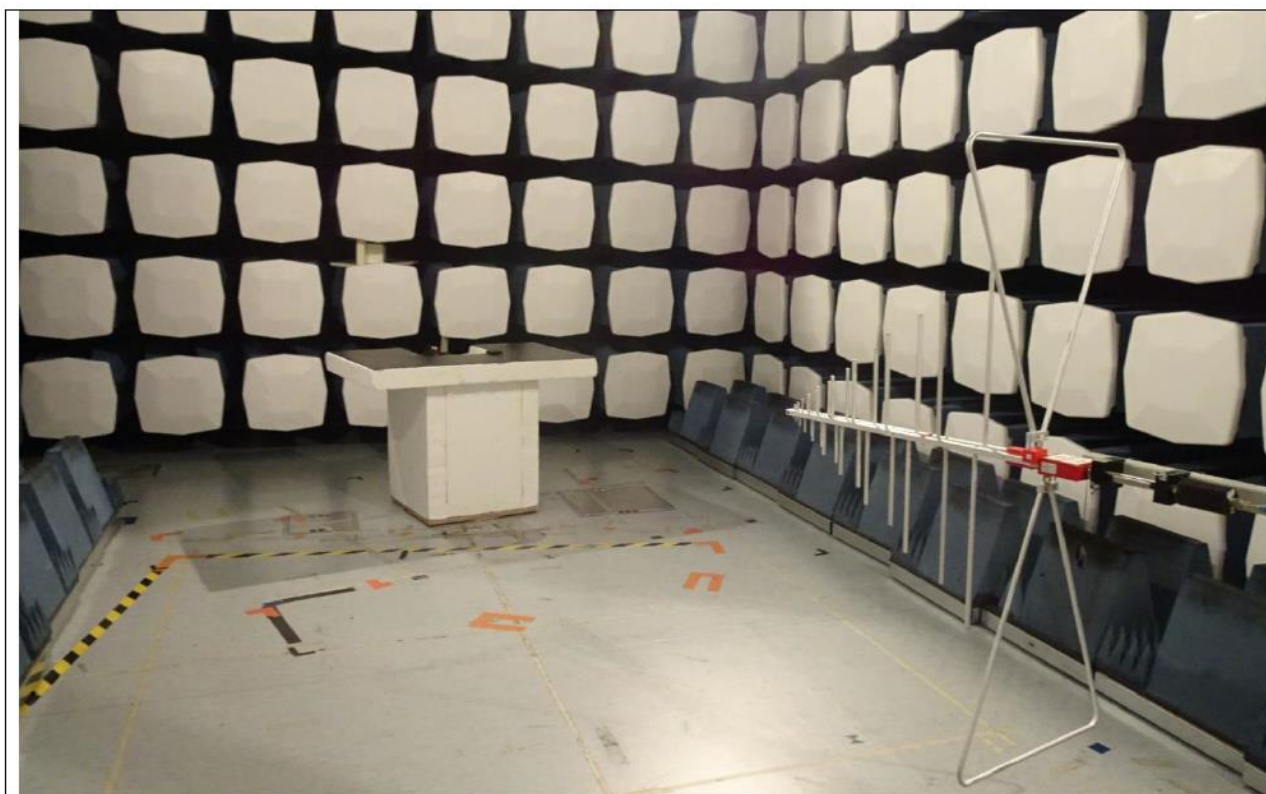
Picture 9, Radiated Spurious Emissions, common setup, TX and RX 30 - 1000 MHz