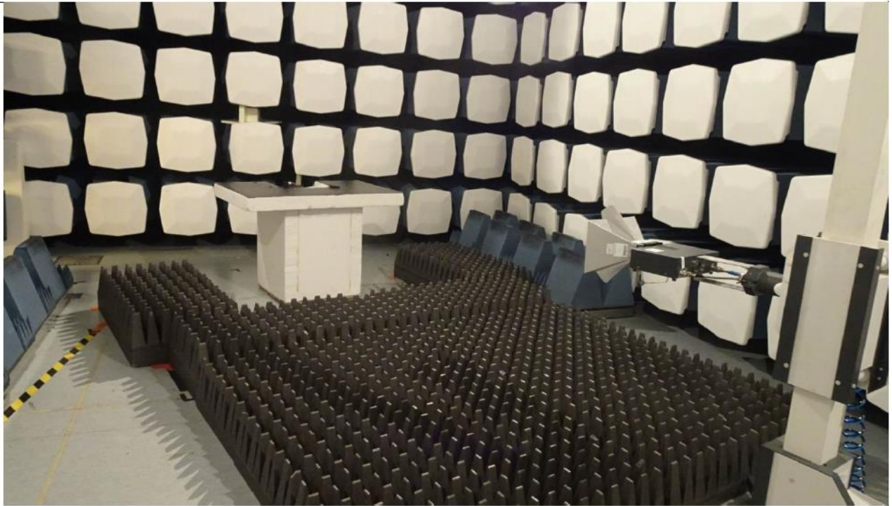
Picture 11, Radiated Spurious Emissions, common setup, RX, 1 – 12,75 MHz