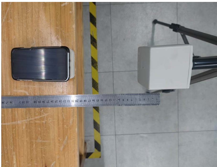
Test Position D-20cm from the edge of EUT to the geometric center of the probe