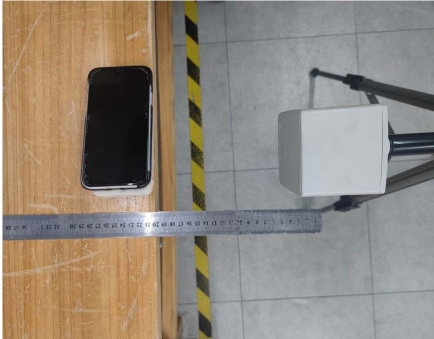
Test Position A-20cm from the edge of EUT to the geometric center of the probe