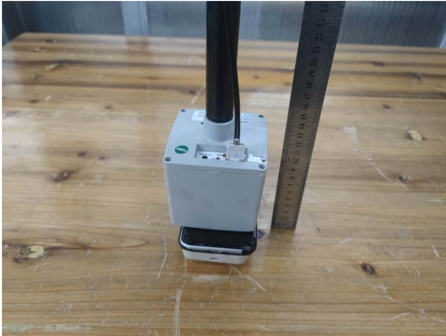
Test Position E-0cm from the edge of EUT to the geometric center of the probe