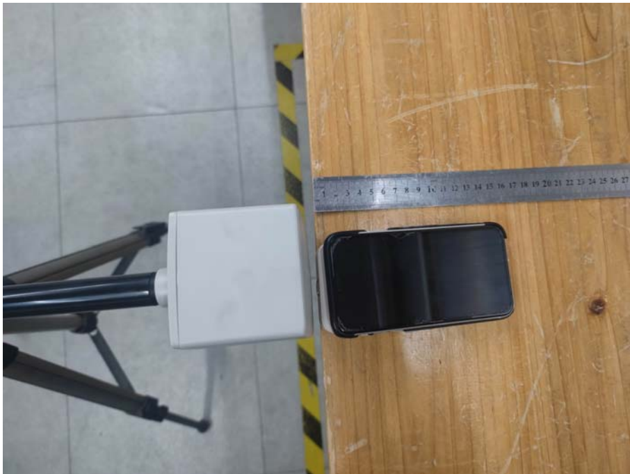
Test Position D-0cm from the edge of EUT to the geometric center of the probe