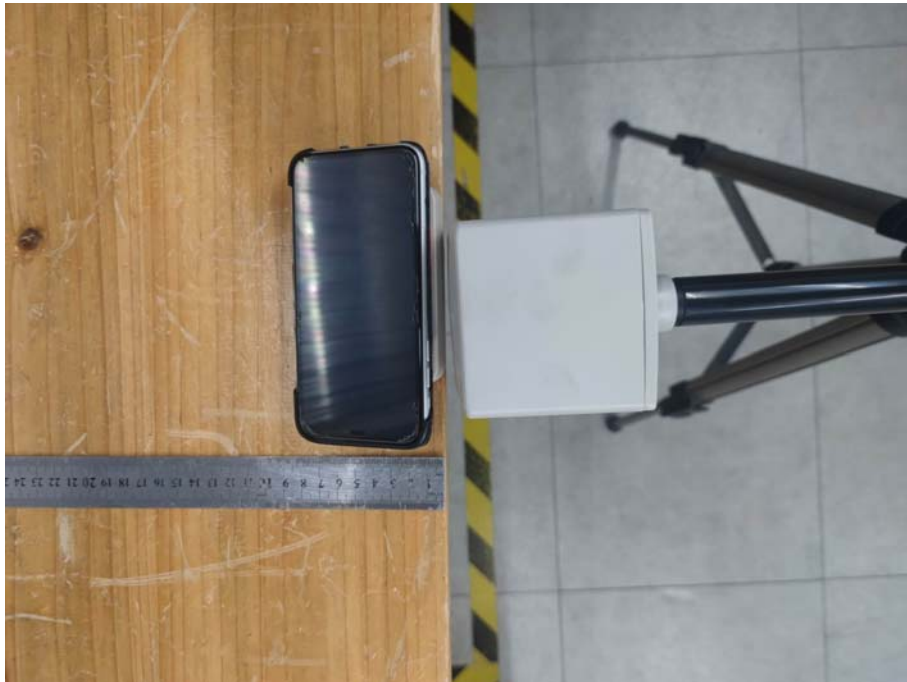
Test Position A-0cm from the edge of EUT to the geometric center of the probe