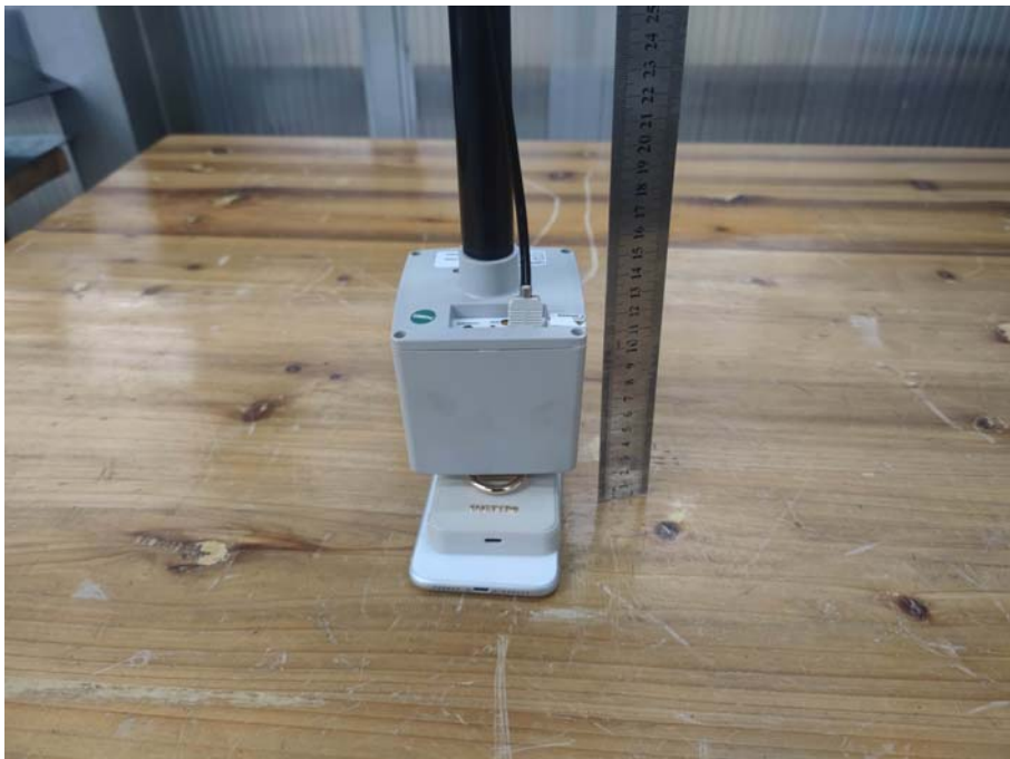
Test Position F-0cm from the edge of EUT to the geometric center of the probe