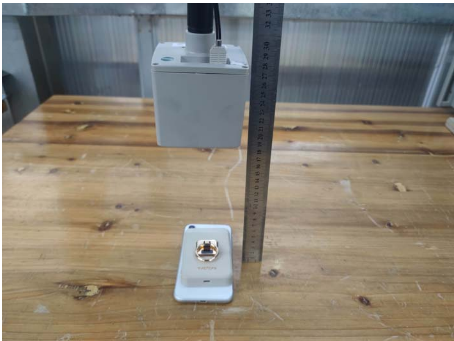
Test Position F-20cm from the edge of EUT to the geometric center of the probe