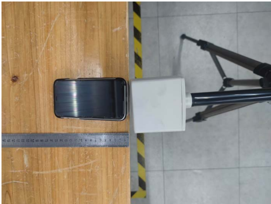
Test Position B-0cm from the edge of EUT to the geometric center of the probe