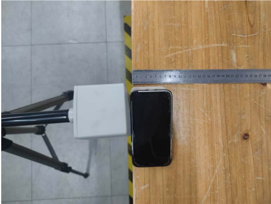
Test Position C-0cm from the edge of EUT to the geometric center of the probe