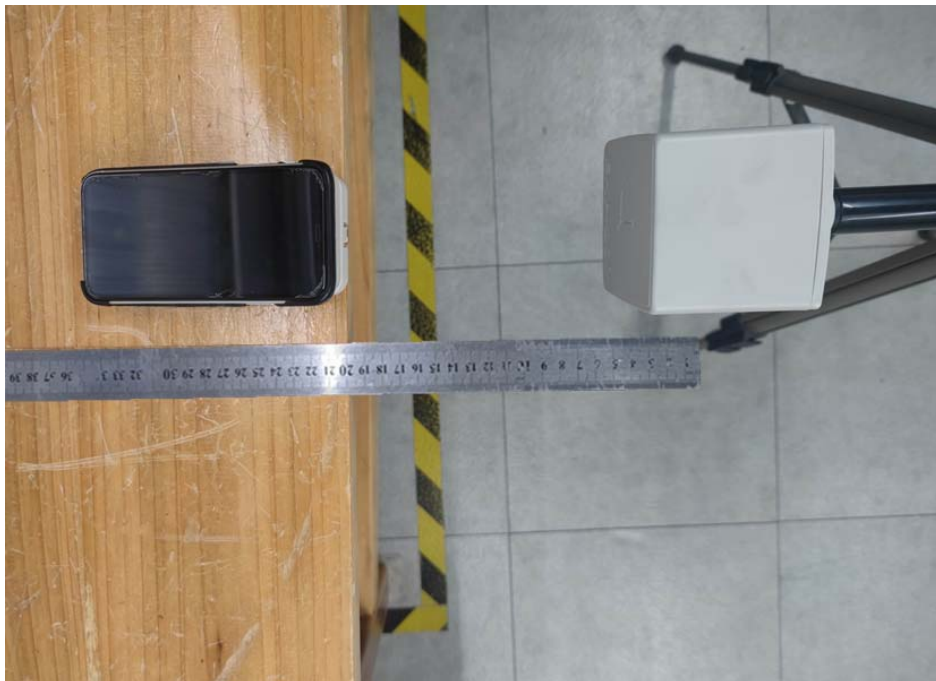
Test Position B-20cm from the edge of EUT to the geometric center of the probe