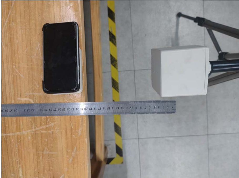
Test Position C-20cm from the edge of EUT to the geometric center of the probe