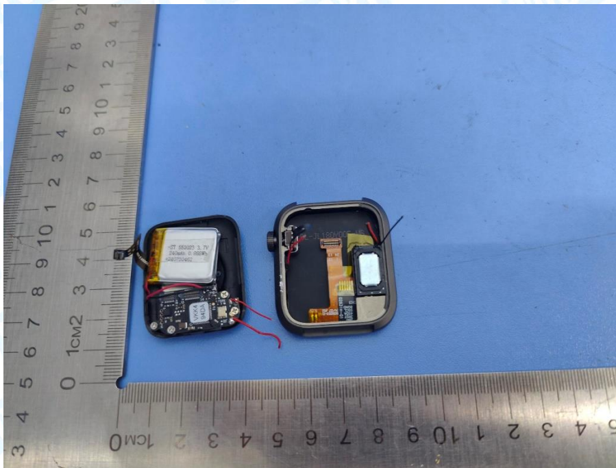
Photo 8 Appearance of PCB