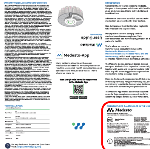
Back of User Guide