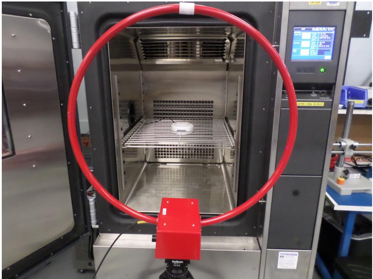
Frequency Stability (Internal Chamber View)