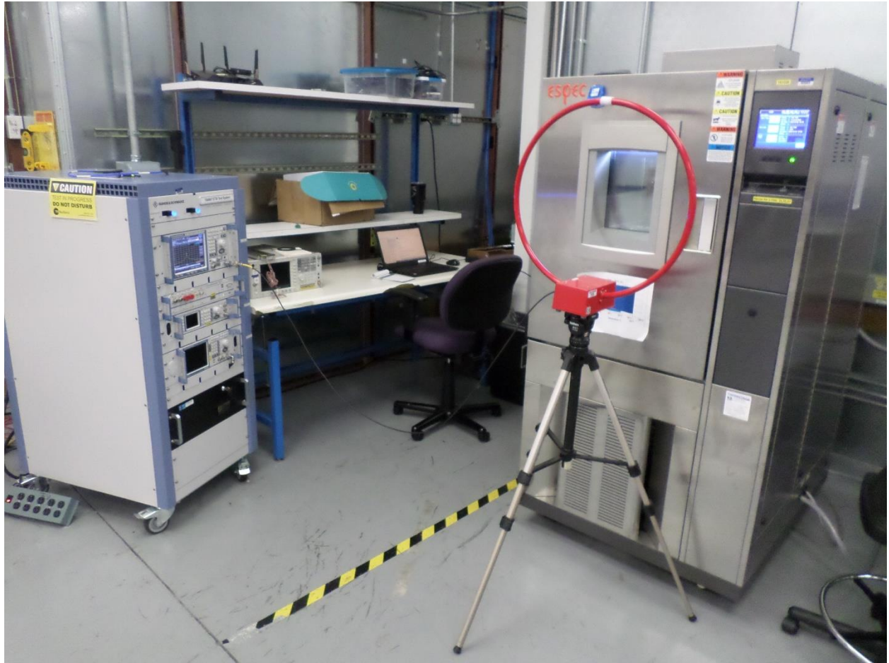
Frequency Stability (External Chamber View)