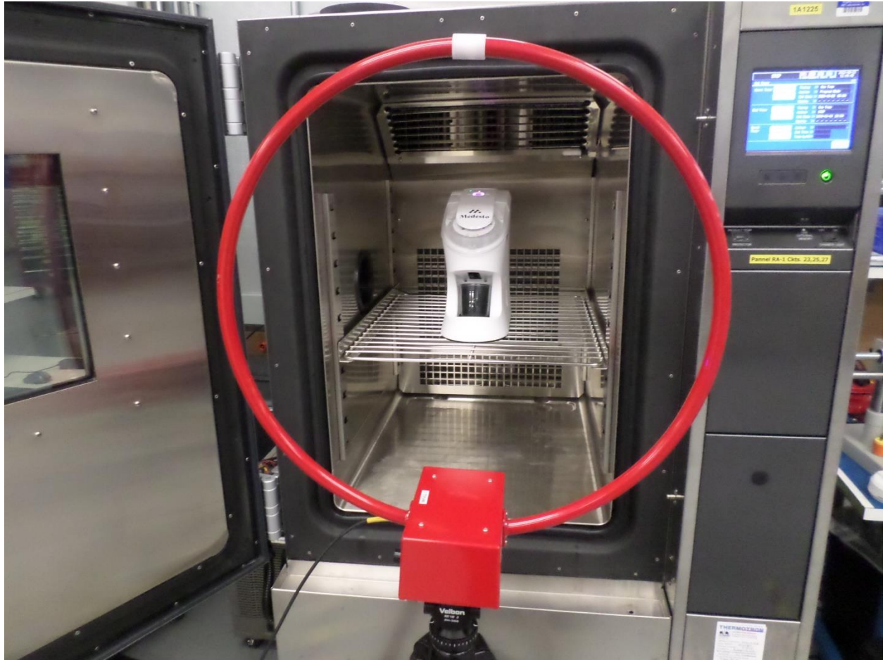
Frequency Stability (Internal Chamber View)