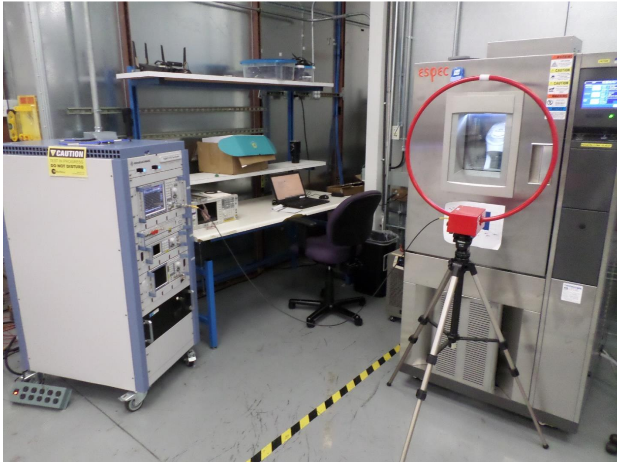
Frequency Stability (External Chamber View)