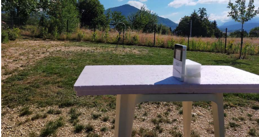
Open Area Test site (9kHz-30MHz)