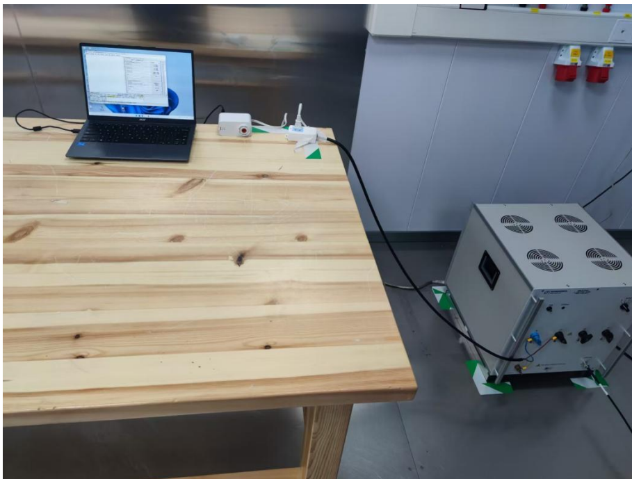
Radiated Measurement Photo (below 1 GHz)