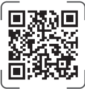
Govee Home App

For FAQs and more information, please visit: www.govee.com