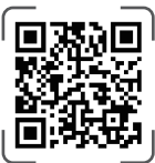
Govee Home App

For FAQs and more information, please visit: www.govee.com