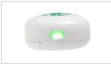
Indicator light "green"Indicates the current "low temperature"

Press "button" to switch the temperature, there are low, medium and high three temperature levels can be regulated. When the indicator light turn to green and start working, at this time in the low temperature state: press the button again indicator light turn to blue, the product is in the middle temperature state; press again, light turns to yellow, the product is in the high temperature state: and so on cycle. (Note that the indicator color varies slightly depending on the model, the specific object shall prevail)