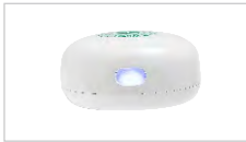
Indicator light "blue" current "medium temperature"