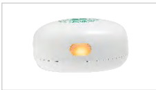
Indicator "yellow" indicates current "high temperature"